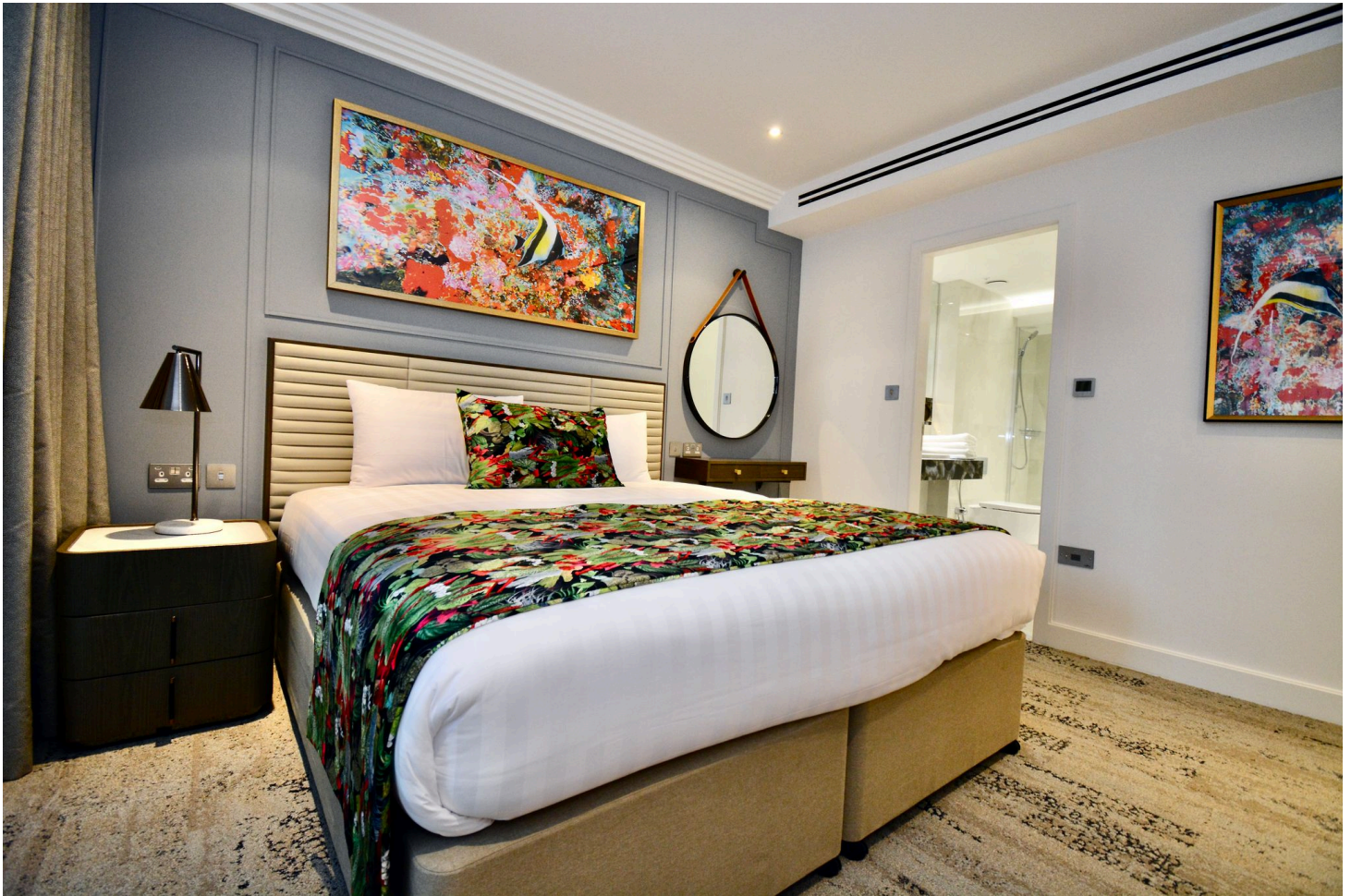
Example Three Bedroom Deluxe Apartment - 126 sqm approx