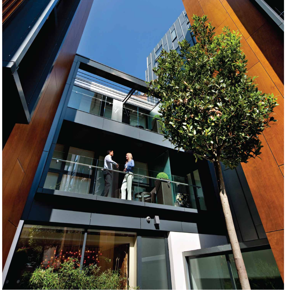
Outside Fraser Residence Bishopsgate

Apartments have yoga mats and weights, allowing guests to exercise from the comfort of their apartment. For those quieter moments, our private patio provides guests with a outdoor space to relax.